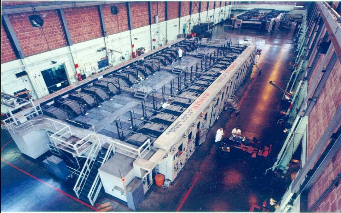
A Beta calutron racetrack at Y-12, which along with the S-50 and K-25 plants made sufficient enriched uranium to fuel the first atomic bomb ever used in warfare, Little Boy. This photo is of the historic Y-12 Building 9204-3 (Beta 3) Beta Calutrons that is now a part of the Manhattan Project National Historical Park. The Alpha calutrons were no longer in use when the S-50 and K-25 feeds were more enriched than the Alphas could produce.

(As reprinted in The Oak Ridger's Historically Speaking column during the week of July 10, 2023)